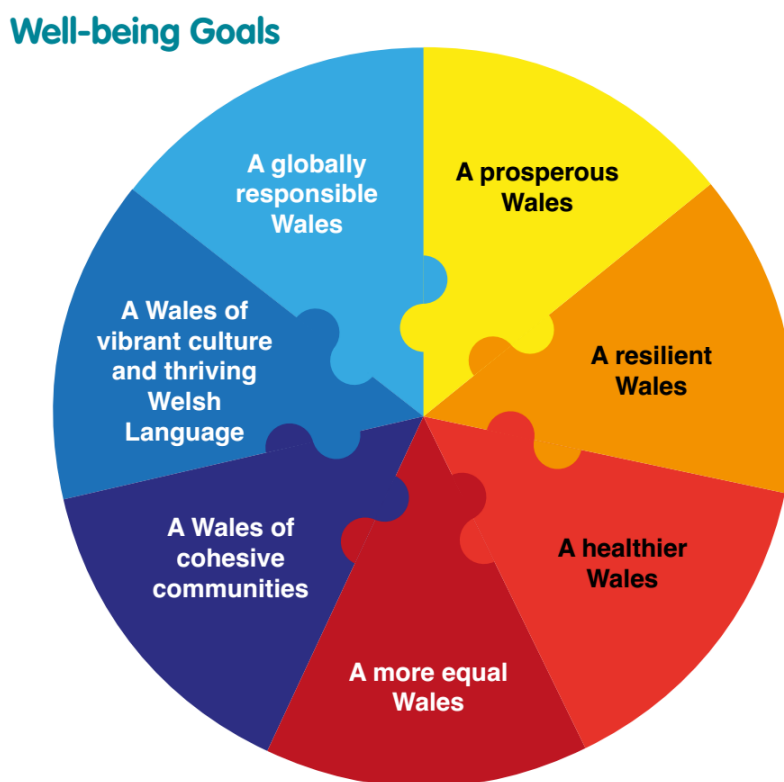
Figure 6.1: Well-being goals

6.2 In guiding the development of the Action Plan, Visit Wales were keen to consider the views and priorities of respondents in relation to the Well-being goals. Therefore, the analysis sought to map and understand the relationships between respondents' views and sentiments and the objectives of each Well-being goal.