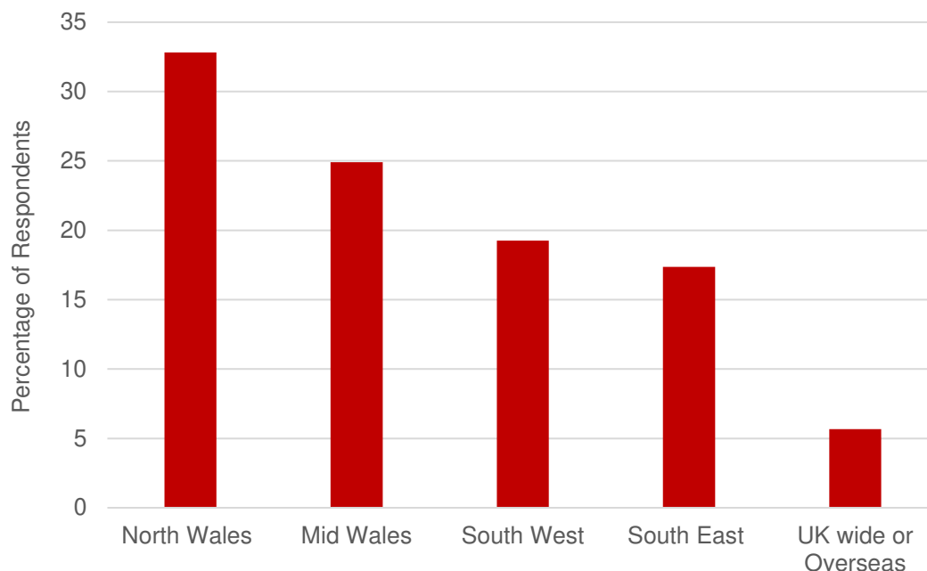
Table 3.2: Respondents' main location (n=265)

3.3 One hundred and twenty-one respondents did not offer information with which to identify in which region they were based (31.3 per cent), and 123 did not provide information on which type of organisation they represented (31.9 per cent).